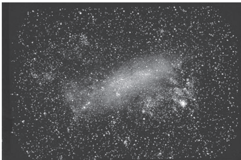
The Large Magellanic Cloud, an irregular galaxy, is close to our own.

An irregular galaxy has no clear shape. It may have as few as 10 million or as many as several billion stars. Some irregular galaxies form when two other galaxies collide.