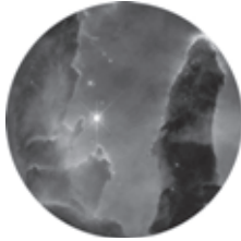
This is part of a nebula. The tall, thin shape to the left of the bright star is wider than our solar system.

A nebula (plural, nebulae or nebulas ) is a large cloud of gas and dust. Most stars are born in nebulas. Some nebulas glow or reflect starlight, but others absorb light and are too dark to see. Therefore, although nebulas can be found throughout a galaxy, they can be hard to see. ✓