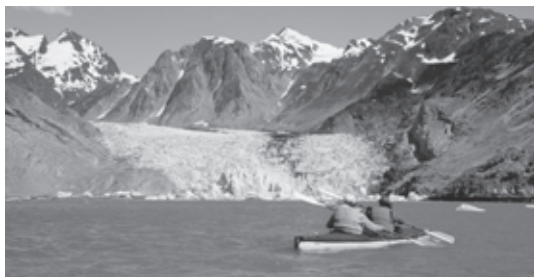
This is McBride Glacier in Alaska.

Thick glaciers move faster than thin glaciers. Glaciers on steep slopes move faster than those on gentler slopes.